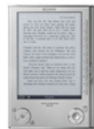
Sony Reader PRS-505 with v1.1 (or newer) firmware