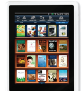
PanDigital® Novel with firmware update